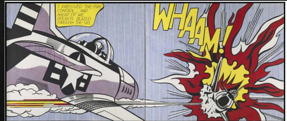
Roy Lichtenstein Whaam! (1963) Tate © Estate of Roy Lichtenstein