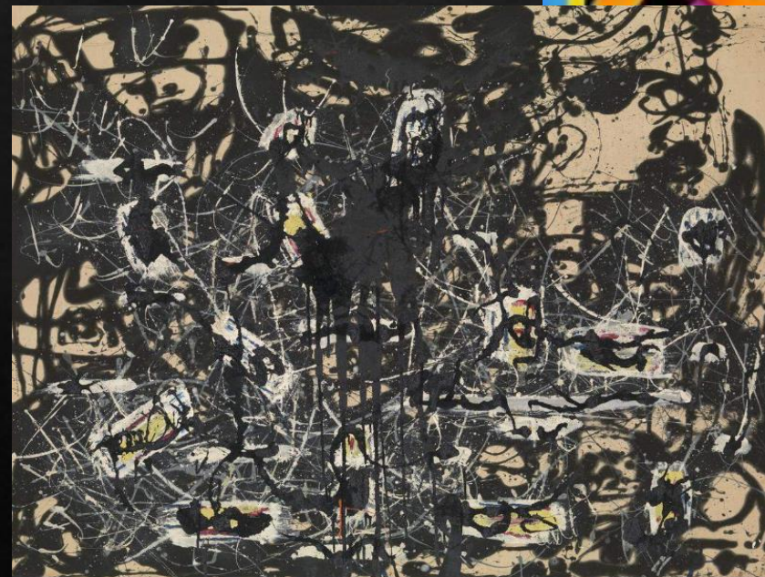
Jackson Pollock Yellow Islands (1952) Tate © ARS, NY and DACS, London 2024